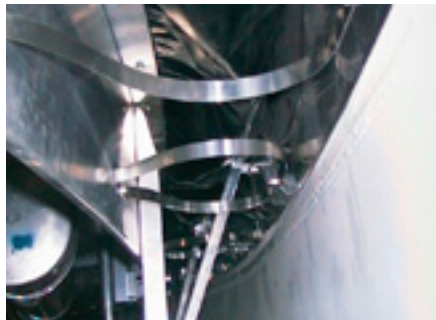
Liquid mounted shoe plate seal on skin and pontoon IFR.