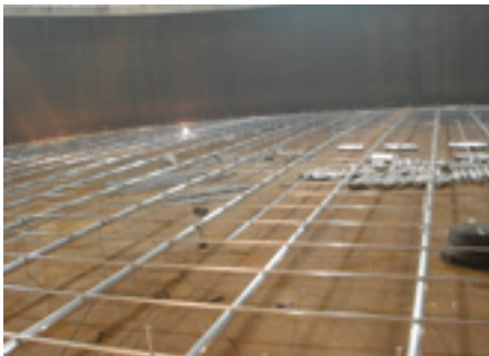
Skin and pontoon IFR under construction, 70m diameter.