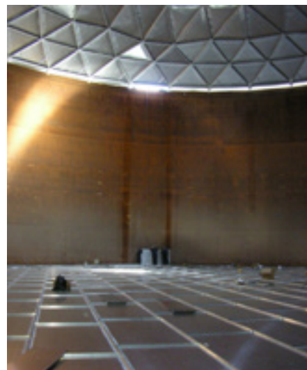
Full contact IFR and aluminium dome.

Obviously this leaflet could not address all details of our internal floating roofs. Full engineering information including material specifications, engineering drawings, references and other relevant information is available upon request. Please do feel free to ask for your copy.