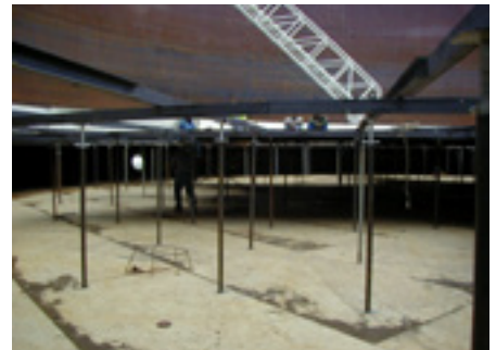
IFR's and domes make a great alternative for replacing a corroded steel roof.