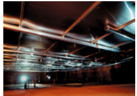
Cable suspended skin and pontoon IFR, bottom view.

All our product information and specifications are drafted with extreme care but can be subject to change. We reserve the right to change product specifications.